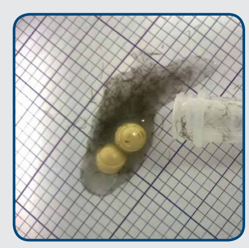
Standard Method (Chopped Hair)